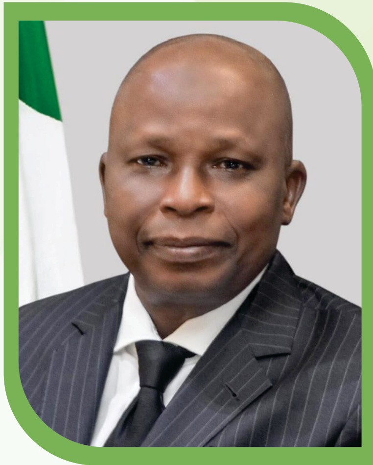
LATEEF OLASUNKANMI FAGBEMI, SAN ATTORNEY GENERAL OF THE FEDERATION & MINISTER OF JUSTICE