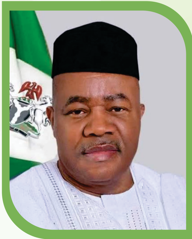
SENATOR GODSWILL AKPABIO, CON SENATE PRESIDENT