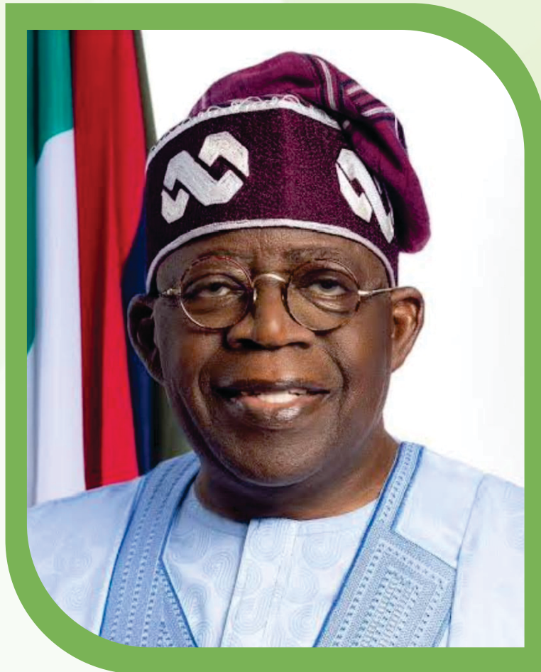
HIS EXCELLENCY BOLA AHMED TINUBU, GCFR PRESIDENT, COMMANDER-IN-CHIEF OF THE ARMED FORCES FEDERAL REPUBLIC OF NIGERIA.