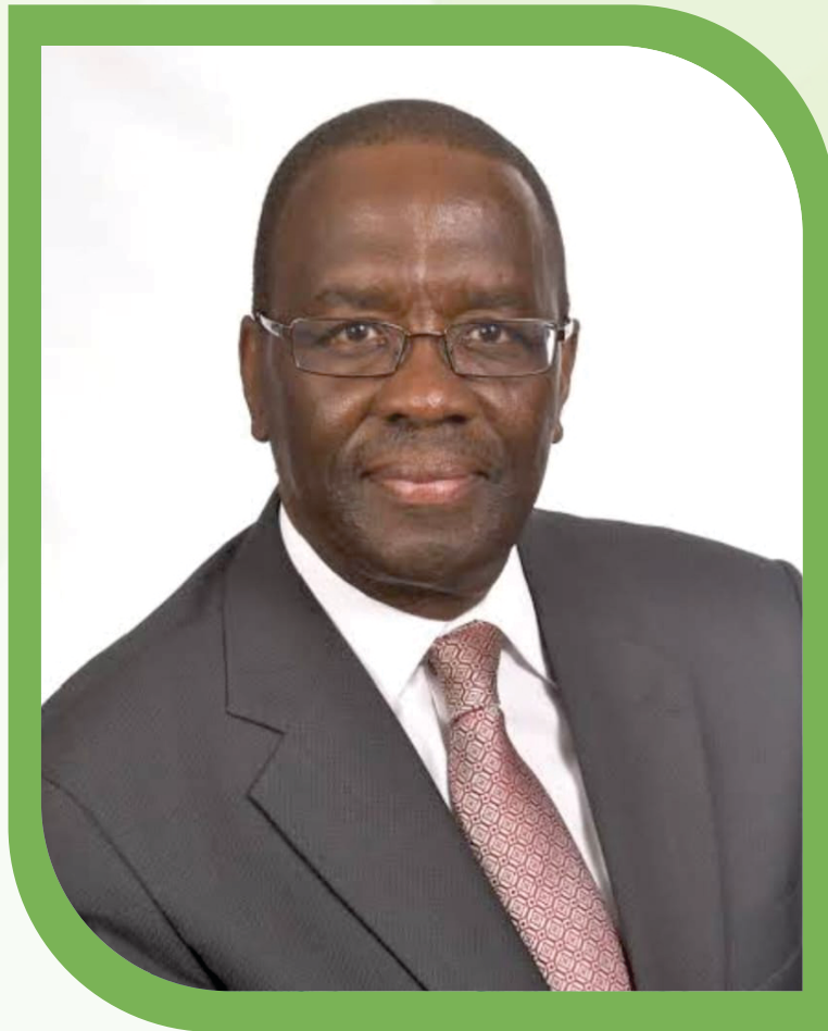
DR. WILLY MUNYOKI MUTUNGA, EGH FORMER CHIEF JUSTICE OF KENYA